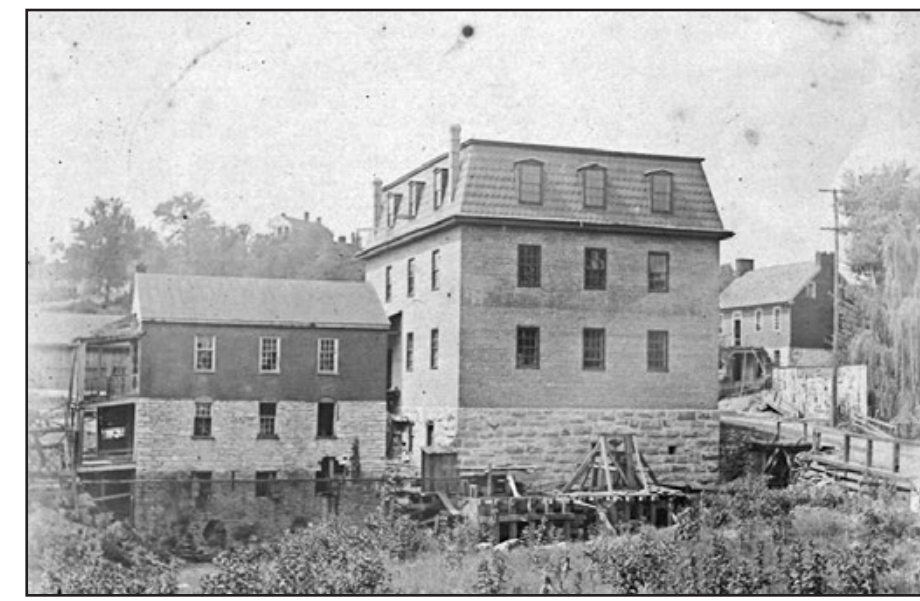
ABOVE is a photo showing Moses Bros. Lexington Roller Mill, with Miller's House in the background. AT LEFT is a view of Moses Mill Road looking north from near the Miller's House, which would have been to the left of this photo. The covered bridge over the Maury River can be seen in the distance under the railroad trestle.